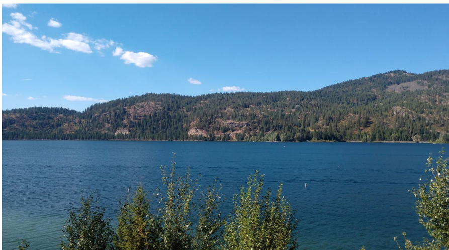
*CCRVP Waterfront view; Summer 2018